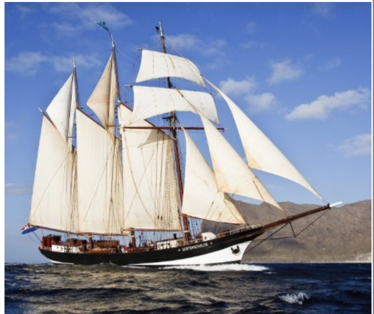
The 3-masted topsail schooner Oosterschelde

Find out more about the Maritime Festival at SailPortsmouth.org .