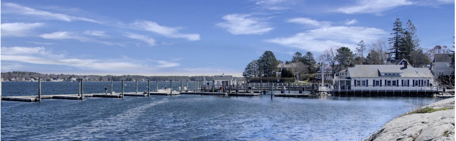
The docks are in for the season! April 18, 2026

Welcome back, everyone! Spring is finally here on the river, and with it comes a renewed energy at Portsmouth Yacht Club. After a long winter, it's great to see familiar faces returning, new members joining, and our season schedule filling up fast.