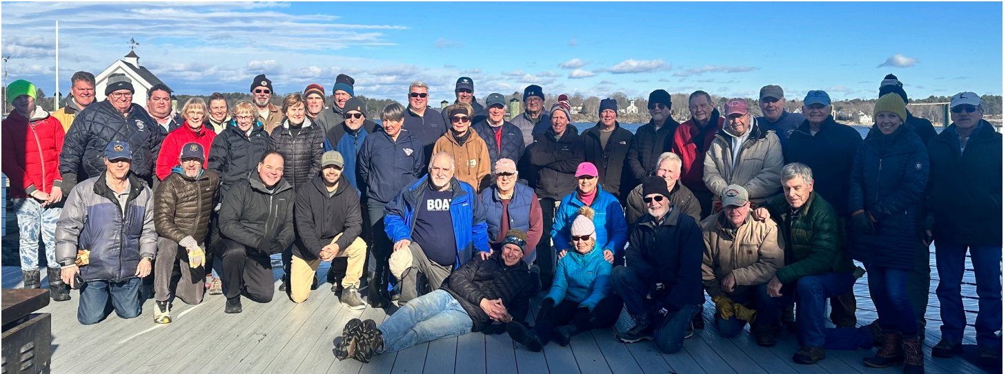
Cleanup Crew, January 14, 2024