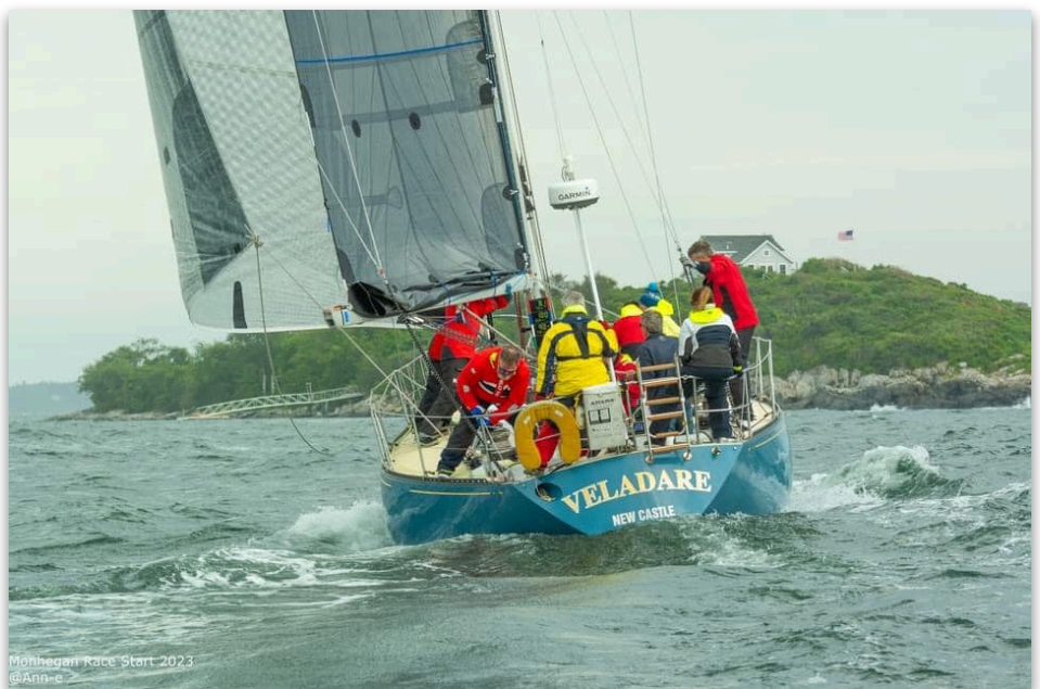
Monhegan Race Start 2023

The Mohegan Island Race is an approximately 141NM course starting in Hussey Sound then turning south to round Boon Island off the coast of York, Maine; then northeast towards Mohegan Island, rounding C"1" Duck Rock Lighted Bell, followed by the finish at Portland Head Light near the entrance to Portland Harbor.