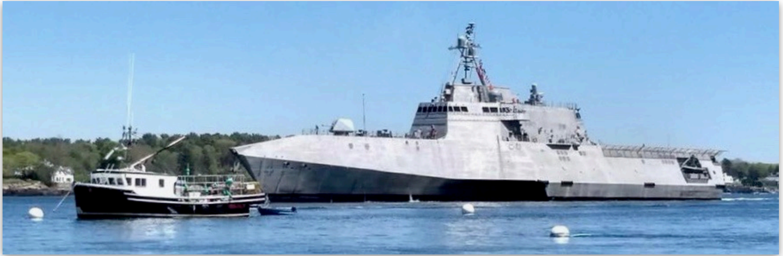
The USS Manchester passing by PYC

The Club is Open! Docks are In! All we need now.....Good Warm New England Weather.