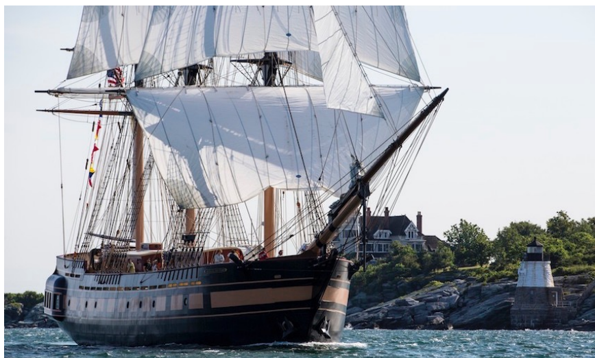
SSV OLIVER HAZARD PERRY

Pre-event - 24 July – Event set up; Marshall Tents; Shipyard Waste, Dame Electric Installs electric drops and emergency lighting in the tent.